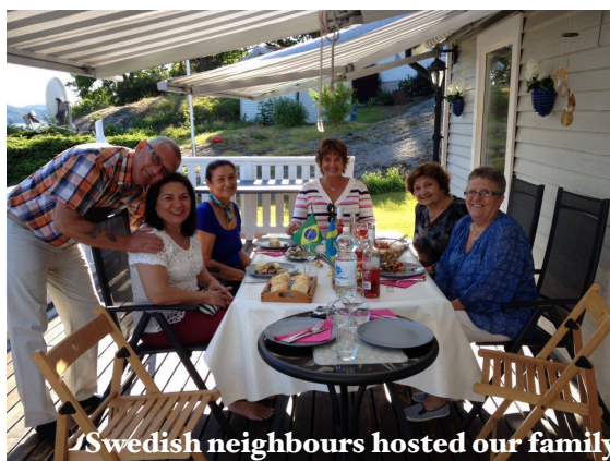
Swedish neighbours hosted our family