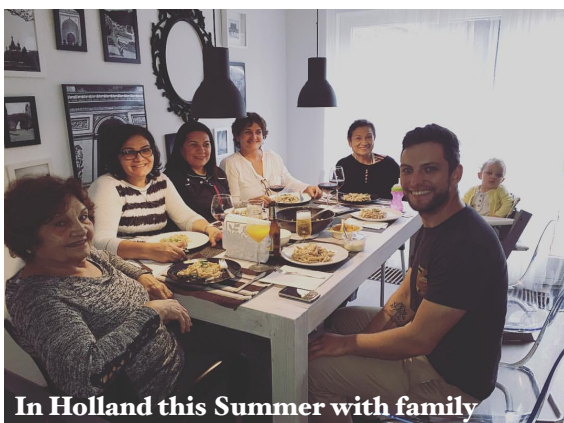
In Holland this Summer with family

R. Alameda das Margaridas 1275 apt. 1501 Tirol Natal, RN 59020-580 Brazil