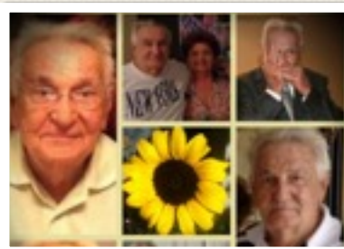
LOST MY FATHER