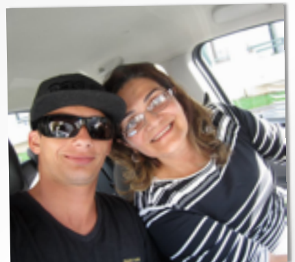
PRAY FOR GABRIEL