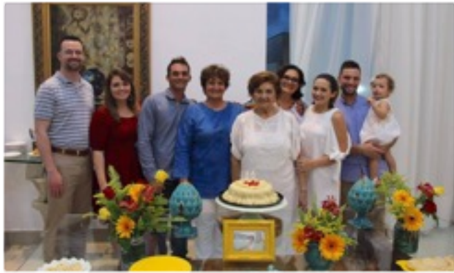
Family celebrating mom!